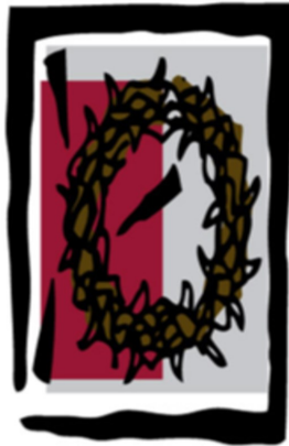
Maundy Thursday March