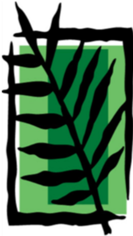
Palm Sunday March

Join us as we observe the somber sounds of the Lenten Season. We cannot fully appreciate the glory of Easter without first going to the cross of Calvary.