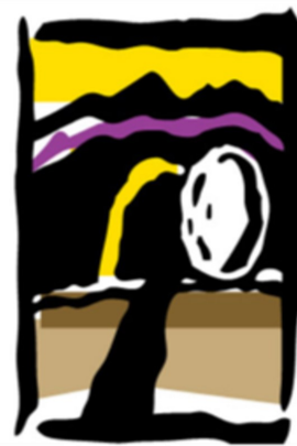
Easter Sunday March