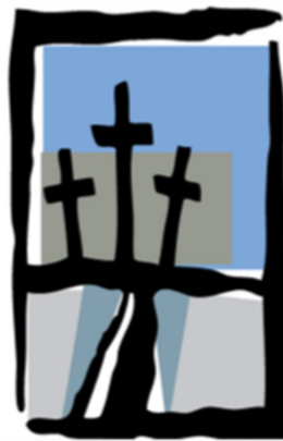
Good Friday March